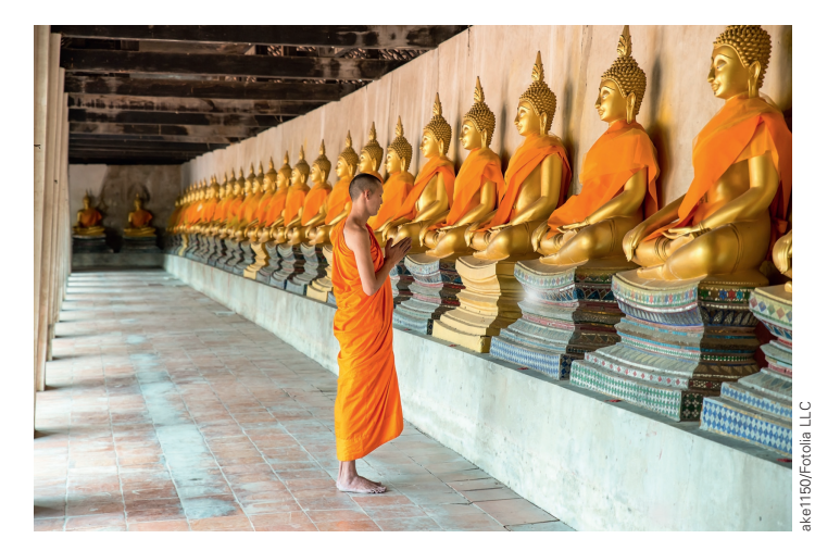
Some religious behaviors may seem unusual to us but are culturally or individually appropriate.

a rating of 4 would indicate continual and severe symptoms (Beesdo-Baum, et al., 2012; LeBeau, Bogels, Moller, & Craske, 2015; LeBeau et al., 2012). These concepts are described more fully in Chapter 3, where the diagnosis of psychological disorders is discussed.