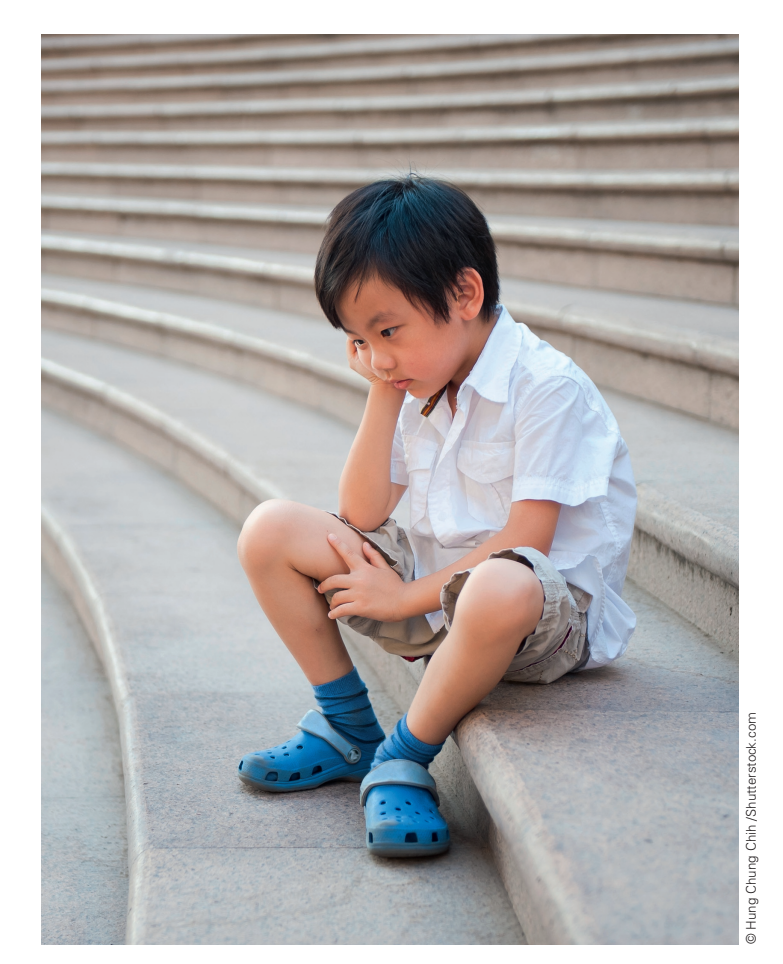
Children experience panic and anxiety differently from adults, so their reactions may be mistaken for symptoms of physical illness.

Etiology , or the study of origins, has to do with why a disorder begins (what causes it) and includes biological, psychological, and social dimensions. Because the etiology of psychological